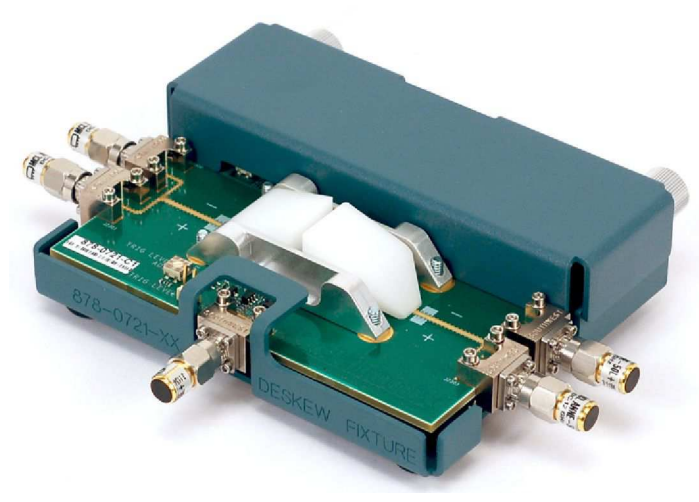
P7600 Series Probes Deskew Fixture