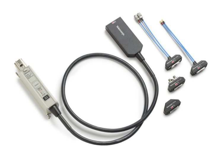
P7630 Low Noise TriMode Probe

The P7600 Series TriMode probes and the MSO/DPO70000DX and DPO/DSA70000D Series Oscilloscopes are designed to deliver the industry's lowest system noise levels. This high sensitivity is critical for being able to make accurate measurements on low amplitude signals.