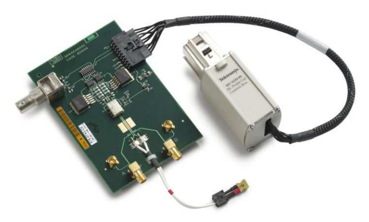
DC Probe Calibration Fixture